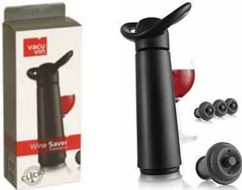
Concerto Wine Saver - Black pump with 4 stoppers 7775 (6)