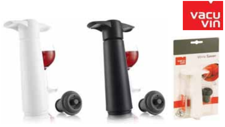
Wine Saver - Black or White pump with 1 stopper on blister card. 7770BLK or 7770WHT (6)