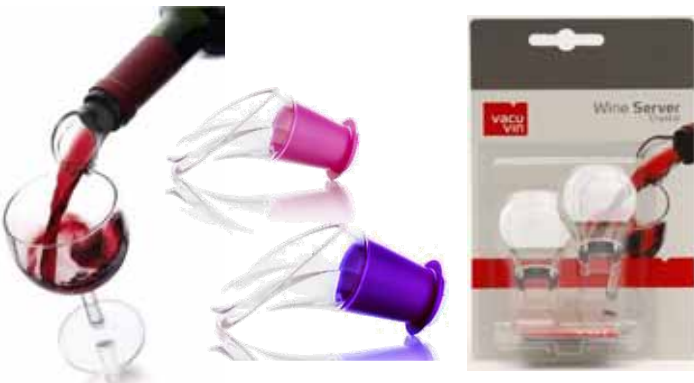
Wine Server Crystal - 2/card, Black 7777* (12) Wine Server - 2/card (Pink & Purple) V1854151* (12)