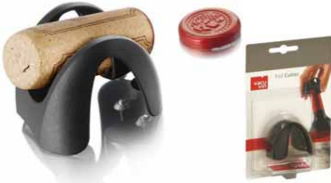
Foil Cutter - Four stainless steel knife edges remove protective foil simply and neatly. V685446 (6)