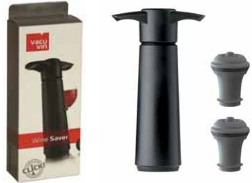
Wine Saver Gift Pack - Black pump with 2 stoppers 7772 BLK (6)