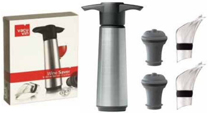
Stainless Steel Wine Saver Set - 1 pump with 2 stoppers & 2 Crystal Servers V649360* (6) *Special Order