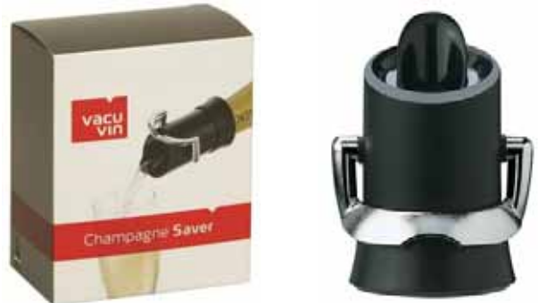
Champagne Saver & Pourer 7830* (6)