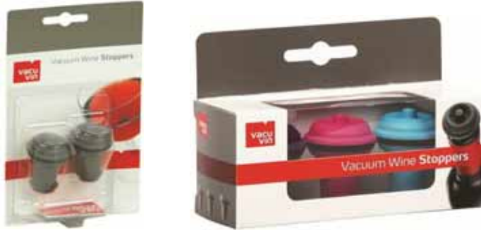
Wine Stoppers Gray - 2 per card 7771 (12) Wine Stoppers Gray - Bulk, (Bag of 10) 7773 (1) Stoppers - Set of 3 (Pink, Blue & Purple) 7774 (6)